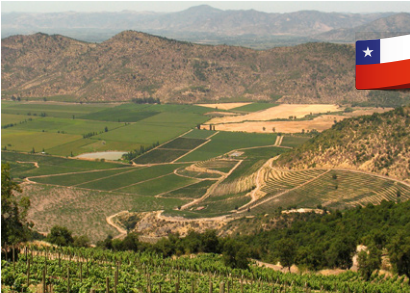
Luis Felipe Edwards vineyards, Chile