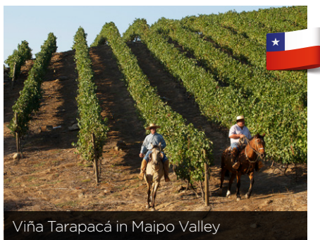
Viña Tarapacá in Maipo Valley